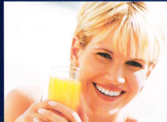
Whitening Improvement Comparison

A: With the proper care, your BriteSmile treatment can last for years. For best results, use BriteSmile whitening products at home to help keep your smile as white as it can be.